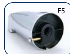
slip connect 5/8" wall end