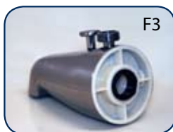
3/4" FIP w/ internal 1/2" FIP face bushing