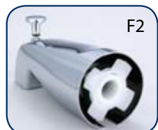
slip connect 5/8" wall end 1 3/8" adjustable