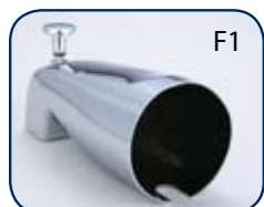
nose end connection