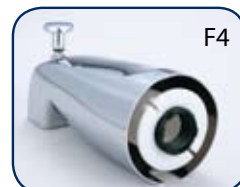
wall connect w/ 1/2"- 3/4" reducer